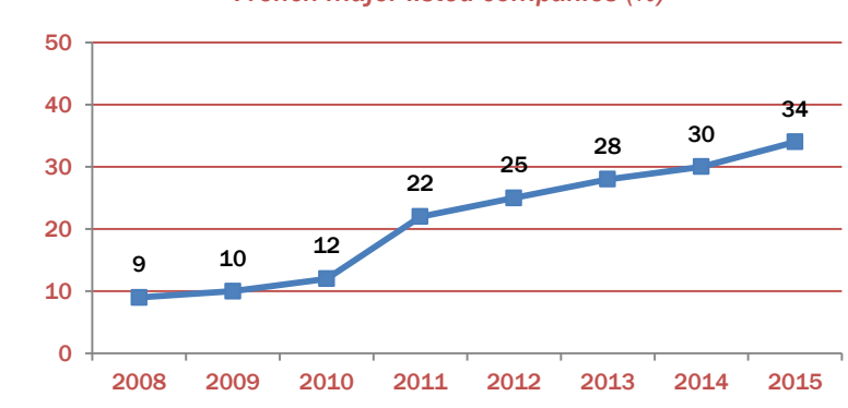
Proportion of women as members of Boards of Directors or Supervisory Boards of French major listed companies (%)